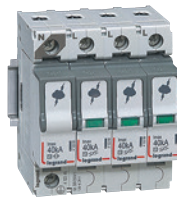
4 122 45